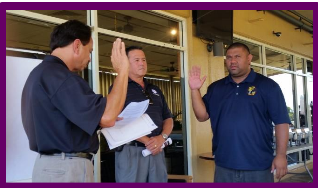
Honolulu, Hawaii, MONTH DAY, 2015. Caption Caption Caption Caption Caption .