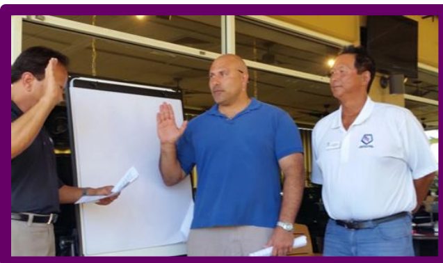
Honolulu, Hawaii, MONTH DAY, 2015. Caption Caption Caption Caption Caption .