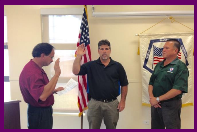
Honolulu, Hawaii, MONTH DAY, 2015. Caption Caption Caption Caption Caption .