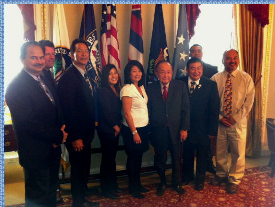
March 14, 2012, Washington DC, FMA Chapter 19 "Day on the Hill" meeting with Senator Daniel Inouye (D). Visit the FMA chapter 19 website for a copy of the our issue brief.