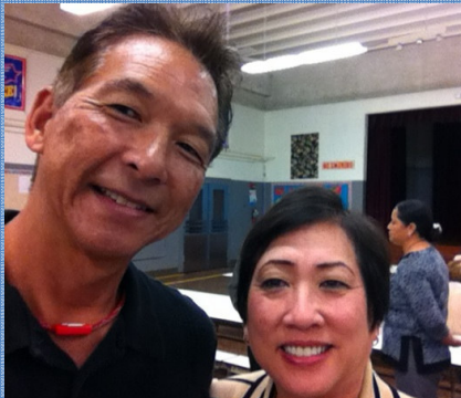
FMA Chapter 19 President visiting with Congresswoman Colleen Hanabusa during an April Town Hall Meeting.