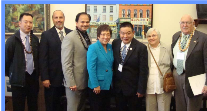
WASHINGTON DC (March 12, 2014) FMA Chapter 19 together with Congresswoman Colleen Hanabusa (D), 1 st District of Hawaii, to discuss issues that affect our local government workforce.