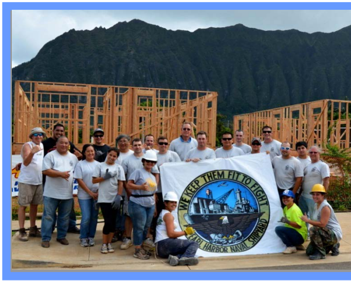
WAIMANALO, HI (October 10, 2013) PHNSY Volunteers together with FMA Chapter 19 supporting a community build project sponsored by Habitat for Humanity. Inside find more pictures of our volunteers hard at work at the Habitat for Humanity gathering.