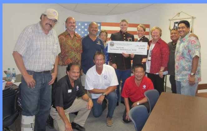
PEARL HARBOR, HI (December 12, 2013) FMA Chapter 19 Executive Board members gather for a photo with USMC Toy's for Tots representative at the annual Holiday Gathering. Last year the gathering was held onboard PHNSY.