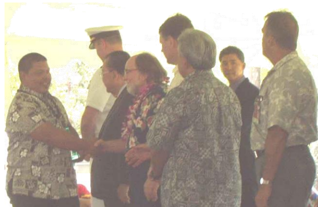
A new journeyman receives a congratulatory handshake from a receiving line that included U.S. Senator Daniel Inouye, U.S. Representative Neil Abercrombie, and U.S. Representative Ed Case

Special thanks to the many people responsible for the establishment and continued growth and improvement of the Apprentice Program, and congratulations to all the graduates for a job well done!