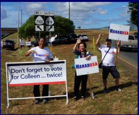
Waipahu, Hawaii October 27, 2016. FMA Chapter 19 support Colleen Hanabusa during a sign waving event at the Waipahu on-ramp. Mahalo to all the Chapter members who took time out of their weekend. Your efforts paid off as Colleen was re-elected to represent Hawaii's First Congressional District.